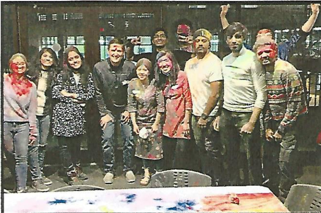
Students at our Holi Festival outreach in March.

What was amazing about this outreach is that our student leaders were the ones who organized and ran the whole event. One student from Nepal organized a game, one student from India lead a time of Bollywood dancing, and a student from Nepal shared about how her faith in Jesus Christ had changed her life.